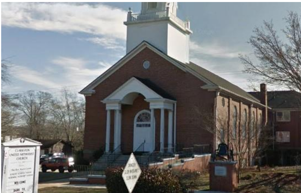
United Methodist Church Where SDA Karen Refugees Meet for Worship

With area bus lines, a railroad line passing directly through downtown Clarkston, low occupancy rates, and relatively low rental rates, Clarkston was selected as a suitable site to house / resettle refugees from overseas. Soon, through the joint efforts of the United States and the United Nations, refugees began flooding in...30,000 over the past decade.